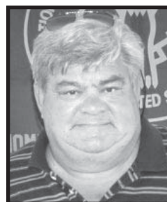
Sterling Huntingford Cotton Redi-Mix